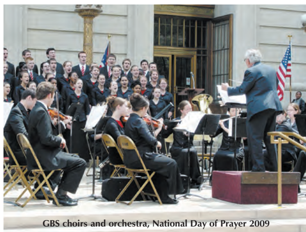
GBS choirs and orchestra, National Day of Prayer 2009

presentations to be offered by the Division: (1) Aldersgate Christian Academy Recital , 7:00 PM, April 29, Adcock Chapel; (2) Oratorio: G.F. Handel's Messiah , 7:00 PM, May 4, Adcock Chapel; (3) National Day of Prayer (Choir and Symphonic Wind and String Ensemble), 11:00 AM, May 6, Courthouse steps, Cincinnati, Ohio; (4) Concert on the Lawn , 7:00 PM, May 11, main campus. ■