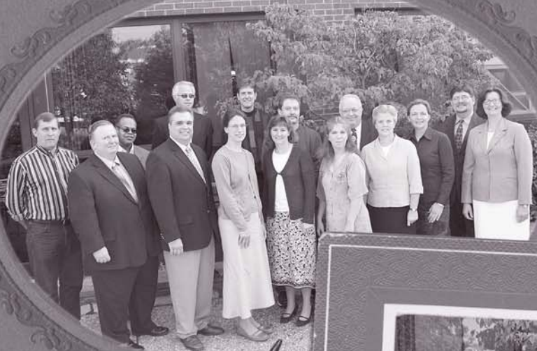
Class of 1957