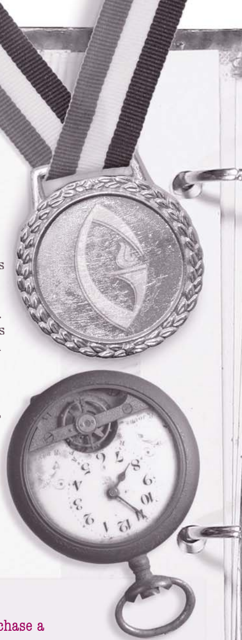
Class of 1982