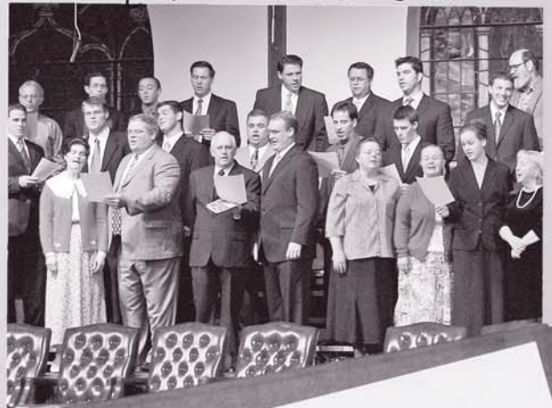
the quartet reunion choir