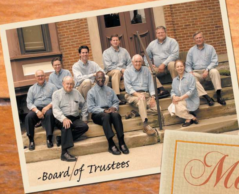
-Board of Trustees