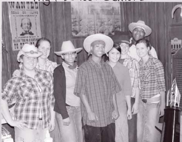
at their Homefest booth