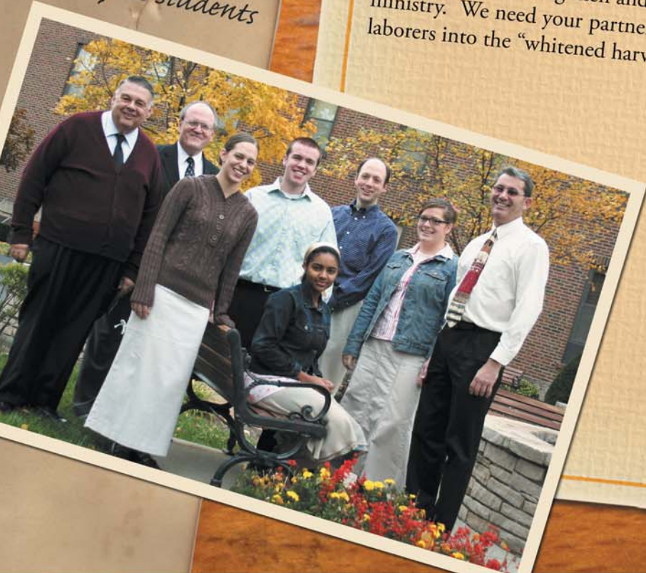
Faculty & Students

Merry Christmas and a Happy New Year!! from the GBS Family