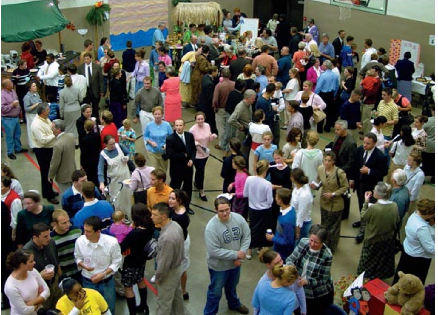
1. A large crowd enjoyed Homefest. A number of student organizations set up booths with a variety of things for sale.