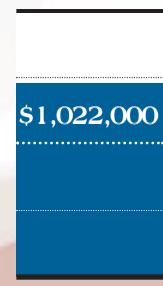
PHASE I $1,400,000