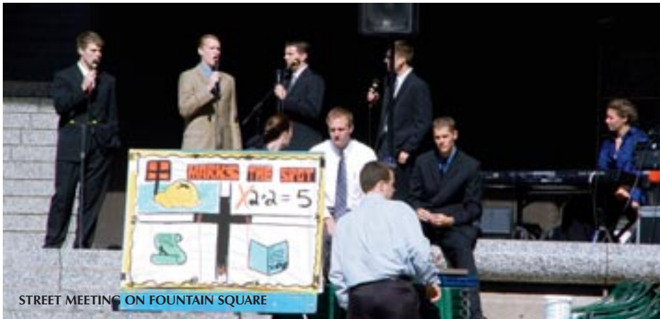
STREET MEETING ON FOUNTAIN SQUARE

songs of the Convention be our heart-cry: Lord, send me anywhere, only go with me, Sever every tie save the tie that binds me closer to Thy heart. —Reported by Anita Brechbill