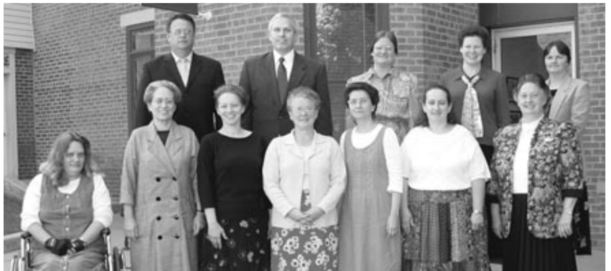
2. Members of the class of 1978 attending their 25 year reunion.