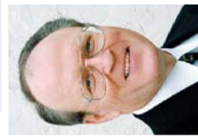
—sermon outline by DR. ALLAN P. BROWN

Consider again the words of the text: "Having therefore these promises, dearly beloved, let us cleanse ourselves from all filthiness of the flesh and spirit, perfecting holiness in the fear of God" (2 Cor. 7:1).